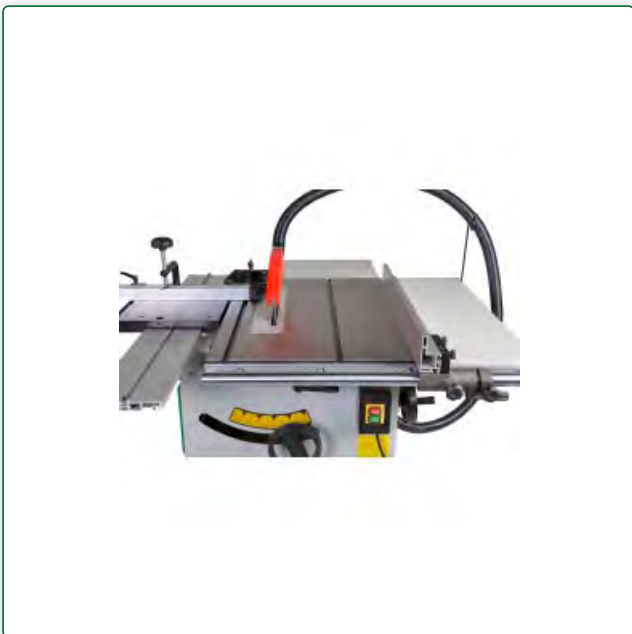
Parallel fence with round bar guide