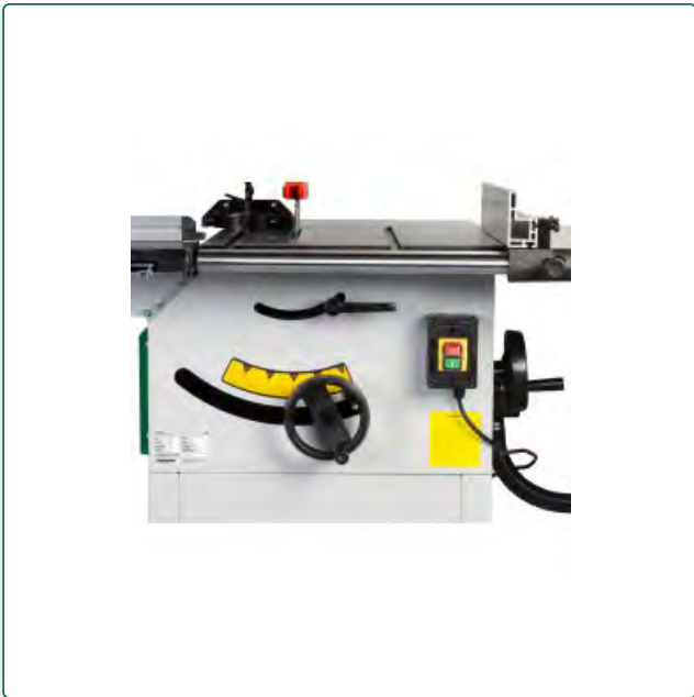
With accurate and smooth height and tilt adjustment of the saw unit through easy-to-use handwheel