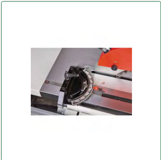
High-quality angle stop included