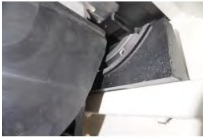
Precise swivel segment guide